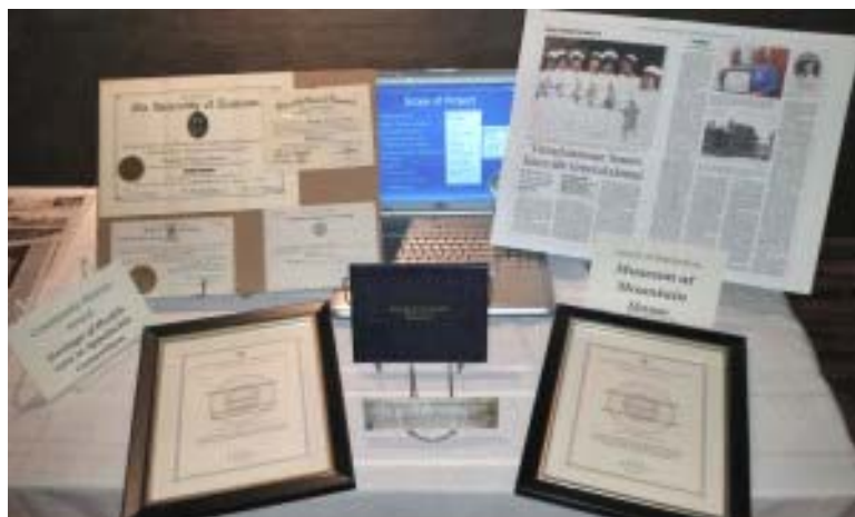
A sampling of artifacts from the KGH museum exhibit was displayed at the ETHS awards dinner.